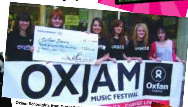
Oxjam Schoolgirls from Dundalk (2007)